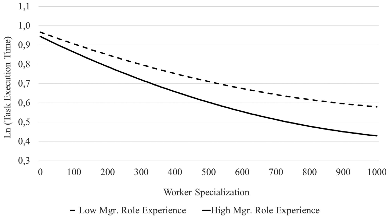
Figure 3 Conditional Effect of Worker Specialization on Task Execution Time at Different Levels of Manager Role Experience (High levels of organizational task experience sample)

value of worker specialization (avg. dif. = 0.09; CI [0.02, 0.20]). In line with prior results, we found no significant differences in the differences of the predicted values when running the analyses for low worker specialization values (10th and 25th percentiles). Our analysis also reveals that there is no significant difference between the predicted execution time values at high levels of worker specialization and manager role experience when comparing the predictions at low and high levels of organizational task experience. The same comparison yields significant results, however, when manager experience is low. In other words, our analysis suggests that at high levels of worker specialization, the difference in differences of the predicted values of Ln(Task\ Time_{ijk}) is driven by reduced execution time of tasks supervised by inexperienced managers, not an increase in execution time of tasks supervised by managers with high role experience. Taken together, these results support our hypothesis that the moderation effect of manager role experience on the worker specialization-performance relationship is stronger at low levels of organizational task experience compared with high levels.